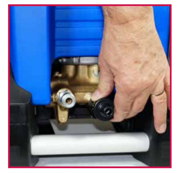
1. Remove water inlet coupling from machine.