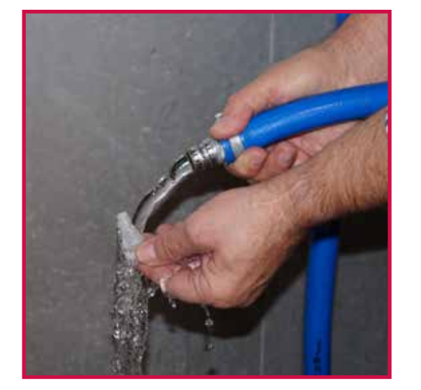
3. Rinse filter with running clean water / or compressed air.