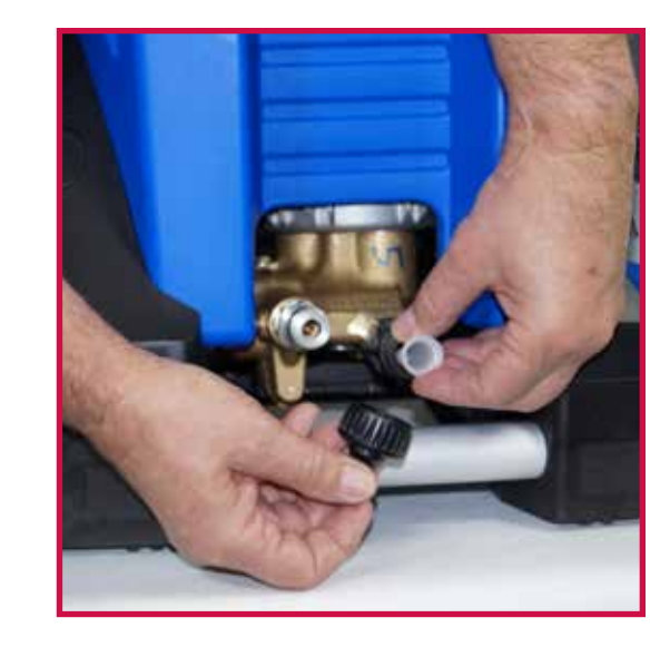
4. Reinstall water inlet filter and water inlet coupling.