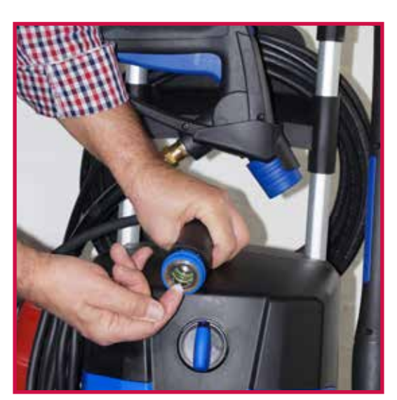
2. 3/8" hose quick coupling being greased. Use water resistant lubricant.