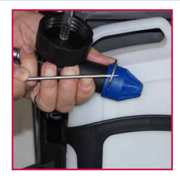
2. Use screwdriver to remove pin on FoamSprayer.