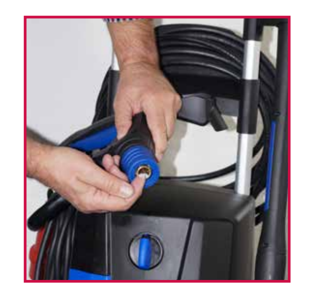
1. Ergo 2000 gun quick coupling must be greased with water resistant lubricant.