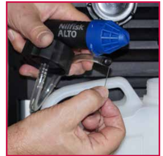
1. Rinse plastic suction nozzle at hose end. Use paper clip or similar.

CHECK SUCTION FILTER / RINSE FOAM SPRAYER SPONGE