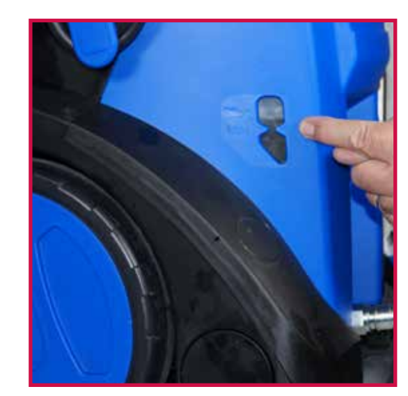
1. Check oil level at right side of cabinet.