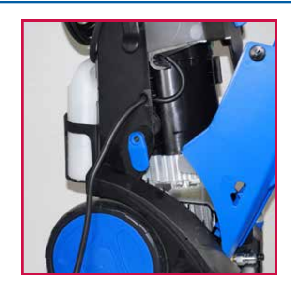
2. Remove front cabinet by turning 2 quarter turn screws at right and left top cabinet side.