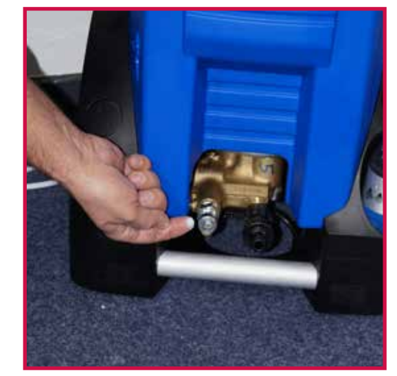
3. 3/8" High Pressure Nipple being greased. Use water resistant lubricant.