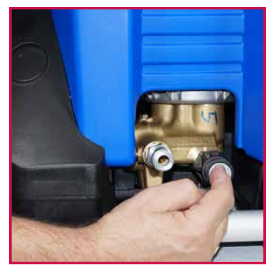
2. Pull out water inlet filter with a finger.