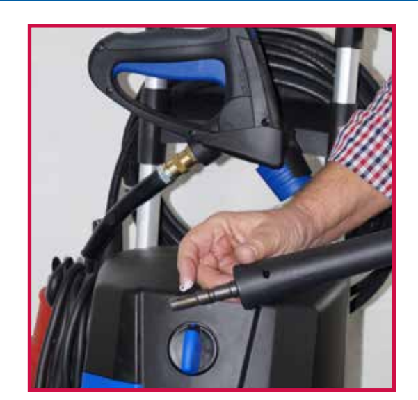
4. Nipplie on lance must be greased with water resistant lubricant.