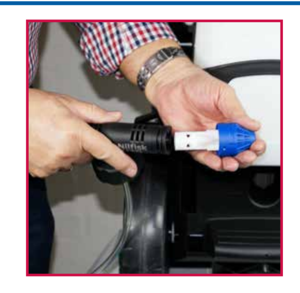
3. Pull out blue front part and separate it from white part.