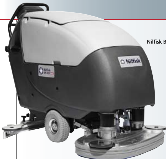
Nilfisk BA 851

More versatility, up to 30 percent greater productivity, better-than-ever reliability, extremely silent operation, and the most advanced ergonomics available. These are some of the reasons why the Nilfisk BA651/751/851 series represents a new generation of scrubber/dryers, and real added value for cleaning professionals. Never before has there been such an outstanding combination of modern ergonomic design, high performance and superb traction. This is the complete walk-behind unit for large area cleaning.