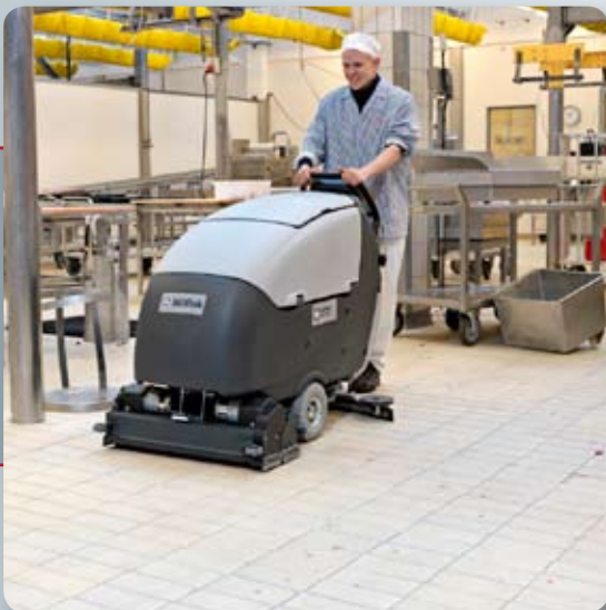
Nilfisk BA 751C